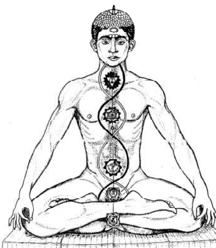
Figure 1. Major Chakras and Nadis

The etheric body is a wonderful thing, a flow of energy analogous to a complex filament in a light bulb. As the body’s energy or electricity flows through it in seven progressions, the filament gradually lights up from bottom to top. In Ecclesiastes (12:6), it is called the “golden bowl.” It is made up of the seven major energy centers and innumerable lesser ones, all interconnected by energy channels that energize the whole body. A major triple channel directly links the seven major centers (see Figure1).